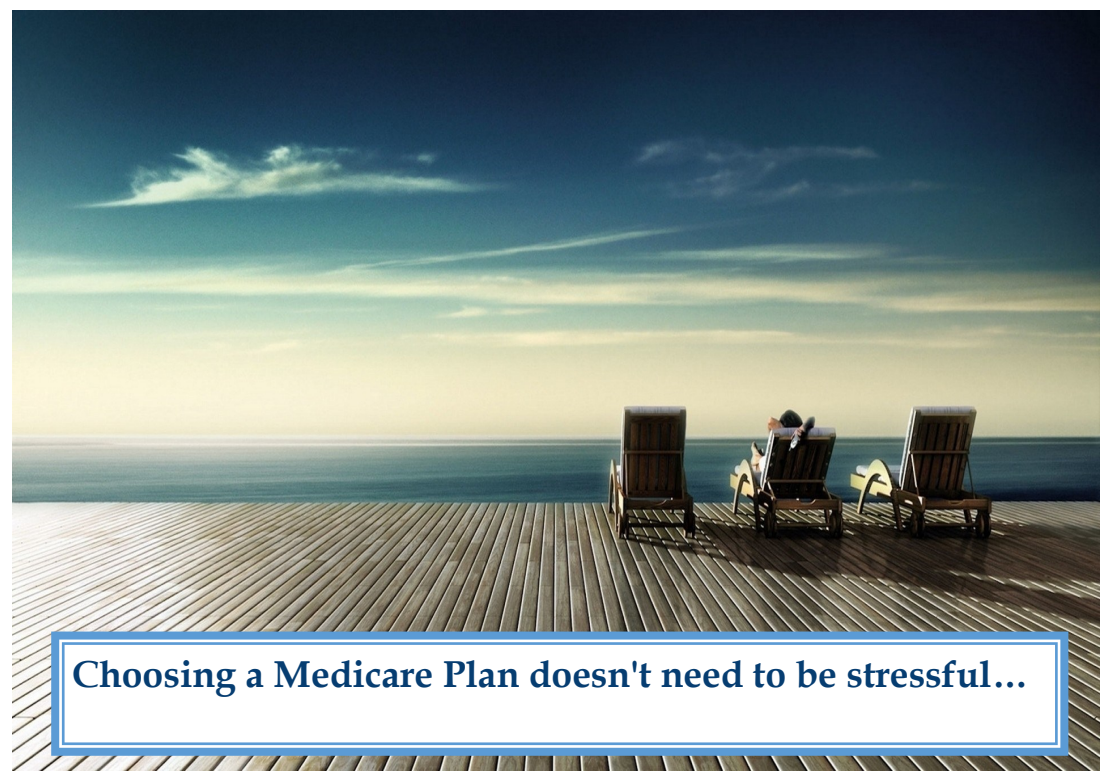
Choosing a Medicare Plan doesn't need to be stressful...