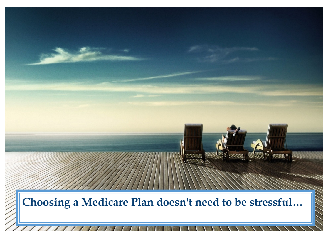
Choosing a Medicare Plan doesn't need to be stressful...